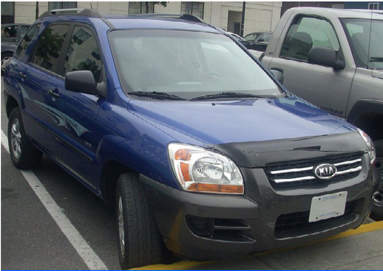
2005-08 KIA Sportage