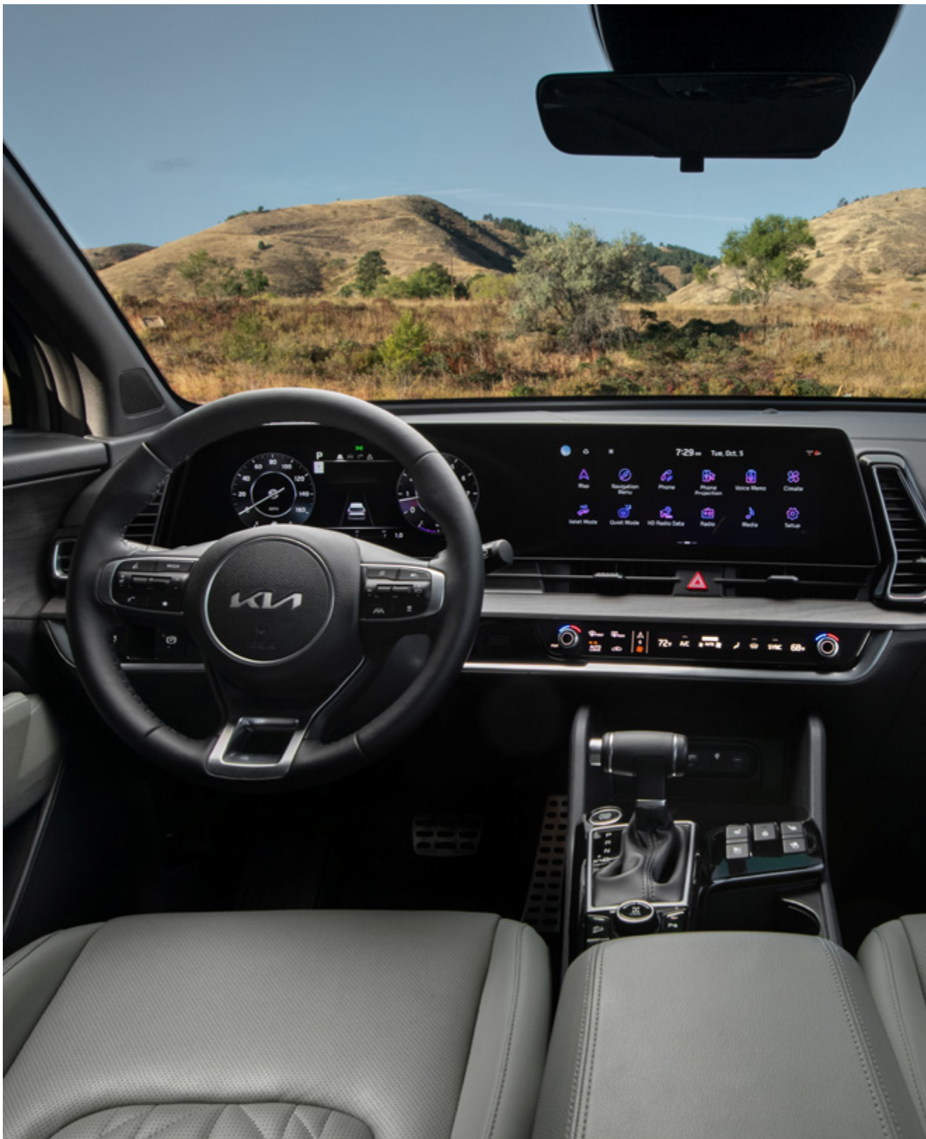
2023 KIA Sportage HEV interior

“it’s very important that you are able to recognise a Kia at first sight” -Peter Schreyer