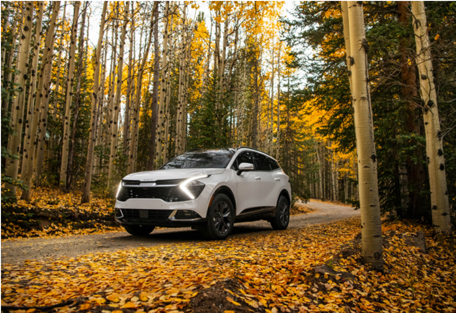
2023 Kia Sportage SX

In 2006, Kia executives identified automotive design as being the “core future growth engine” of the company. Shortly afterwards, Kia hired master designer Peter Schreyer, pivotal contributor of the Audi TT, to serve as Chief Design Officer. This was a tremendous push towards the new direction in which executives wished to take the company, a direction with a major emphasis for modern design. One of Schreyer’s first moves was to create the Kia ‘tiger nose’ grill (now that you have read and comprehend that last line, you will see the stylish innovation every time you look at a Kia, forever). It was a truly brilliant move by him, fueling an early spark that became the company we know today. If Schreyer’s tenure thus far, now serving an even greater capacity as President of design management for Hyundai Motor Group, is any indication of what may be in store, Kia fans may have much about the Sportages future to be happy about. Now offering EV, Hybrid and plug-in hybrid models combined with cutting edge comfort & safety updates, the Sportage certainly seems poised to see a sixth generation, if not a seventh and eighth as well.