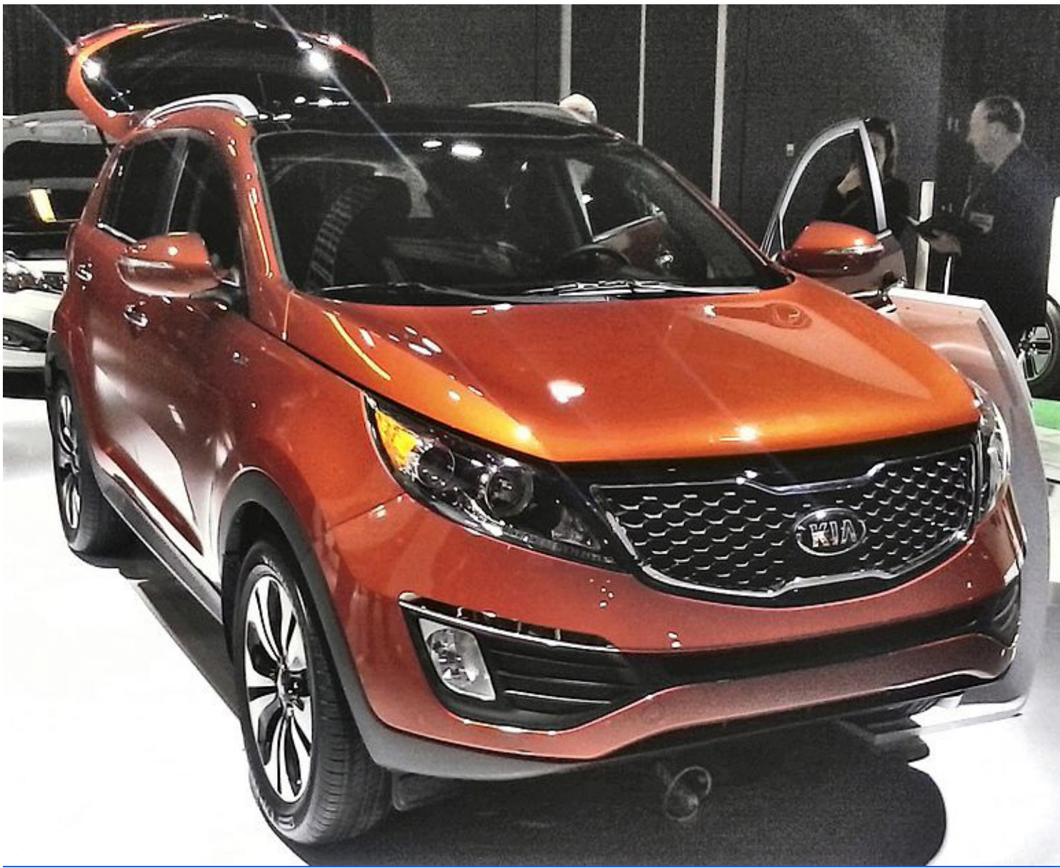
Third Generation 2013 Kia Sportage