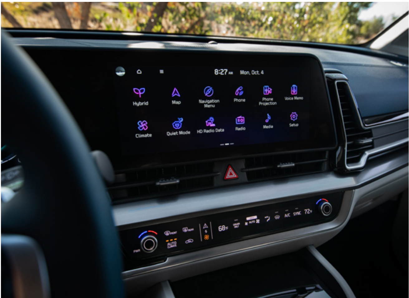
New Infotainmet System