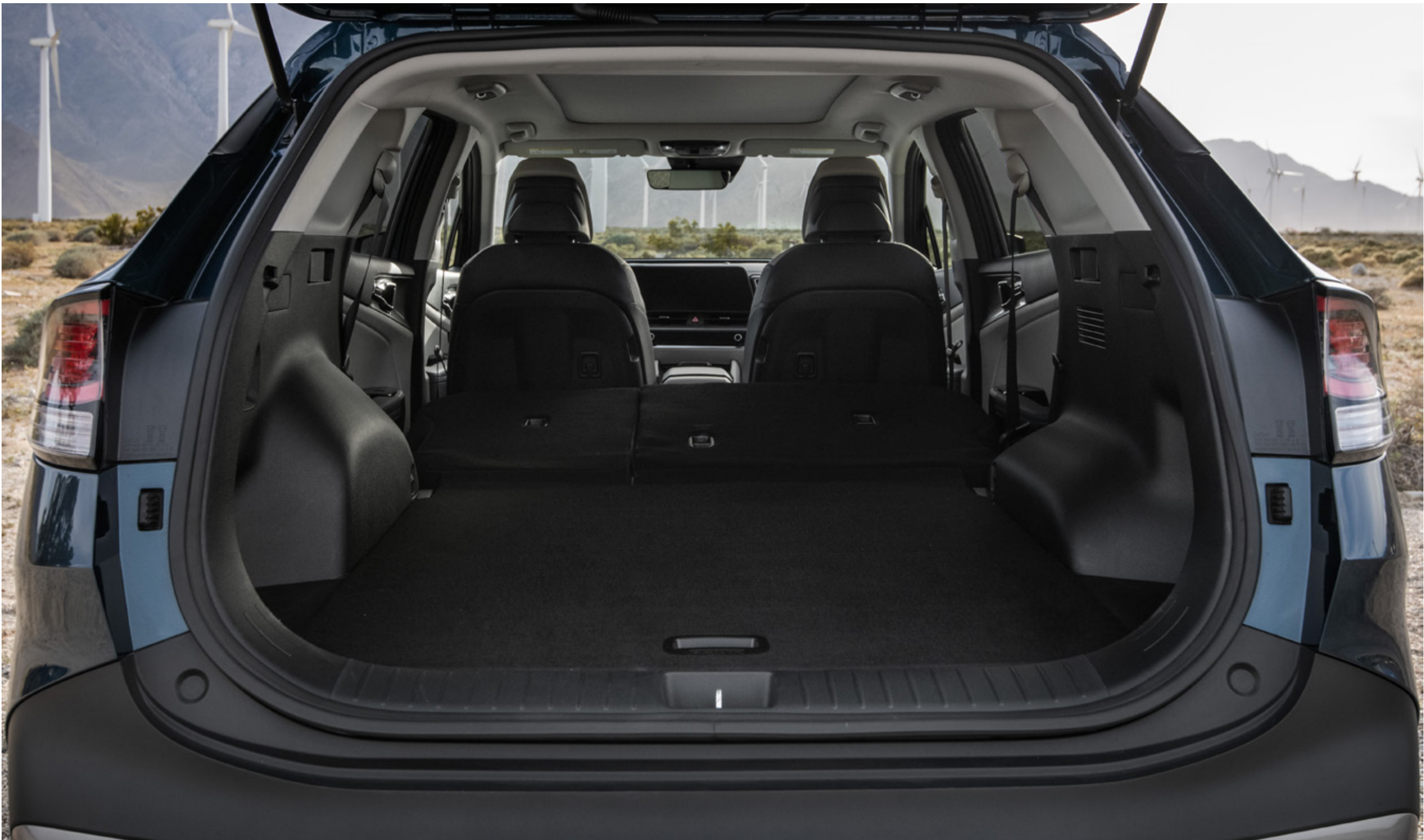
Interior cargo space 74.1 cubic feet