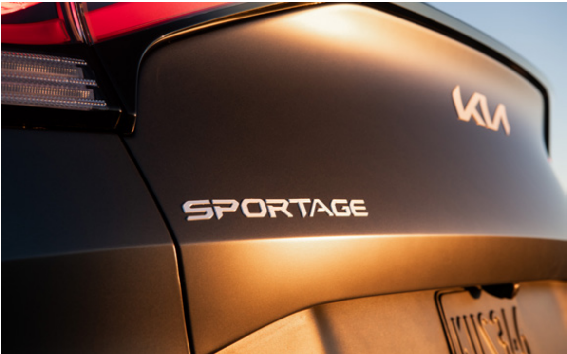
Fifth Generation 2023 KIA Sportage