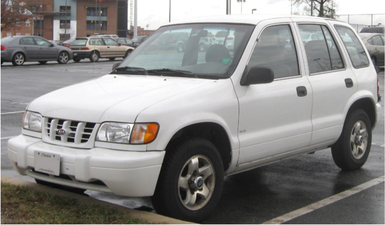
First Generation KIA Sportage 1993-2002 NB-7

The Sportage was born in 1993, but the model’s rise to the top of Kia sales charts was not easy, nor fast. Both the new model and the company as a whole struggled during this time. Like most companies in Asia, Kia was devastated by the 1997 Asian financial crisis that brought about bankruptcy for the company. In addition to the overall struggles of Kia, the Sportage was dogged with slow initial sales on both sides of the pacific. In fact, according to Kia Media, the Sportage only sold a total of about 240,000 units in the United States from 1998, the post Hyundai acquisition, until 2003. Early models were plagued with recalls and safety concerns, all of which were found off putting to discerning American consumers. This culminated with the decision for Kia to temporarily discontinue the Sportage after the 2002 model year.