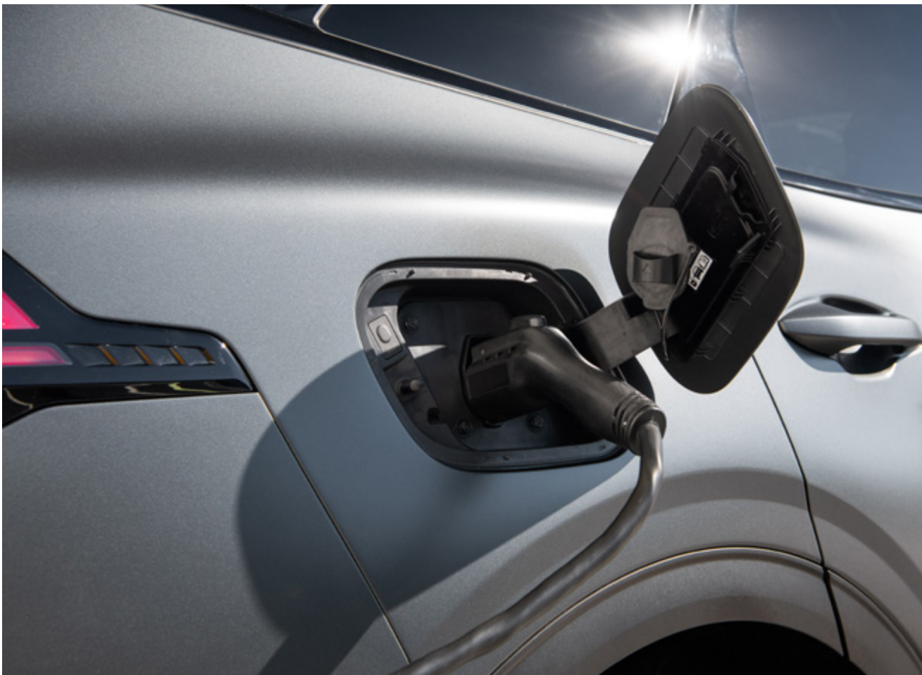
Eco-Conscious 2023 Kia Sportage PHEV