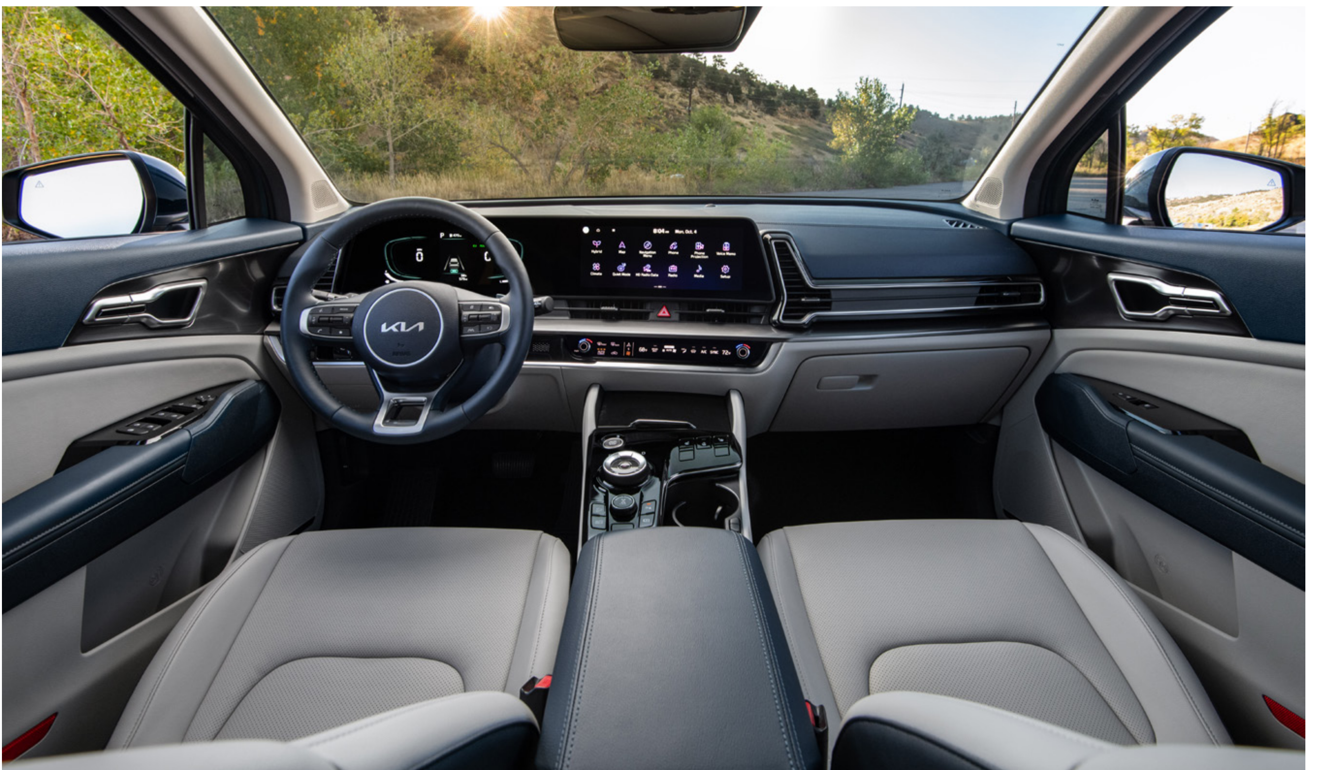
2023 KIA Sportage Cabin