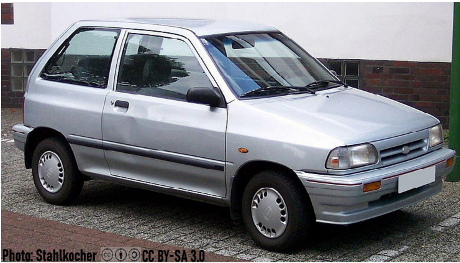
1987–2000 KIA Pride