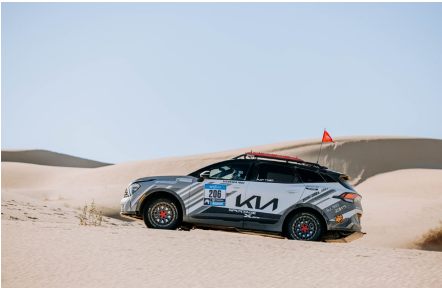
Fifth Generation 2023 KIA Sportage