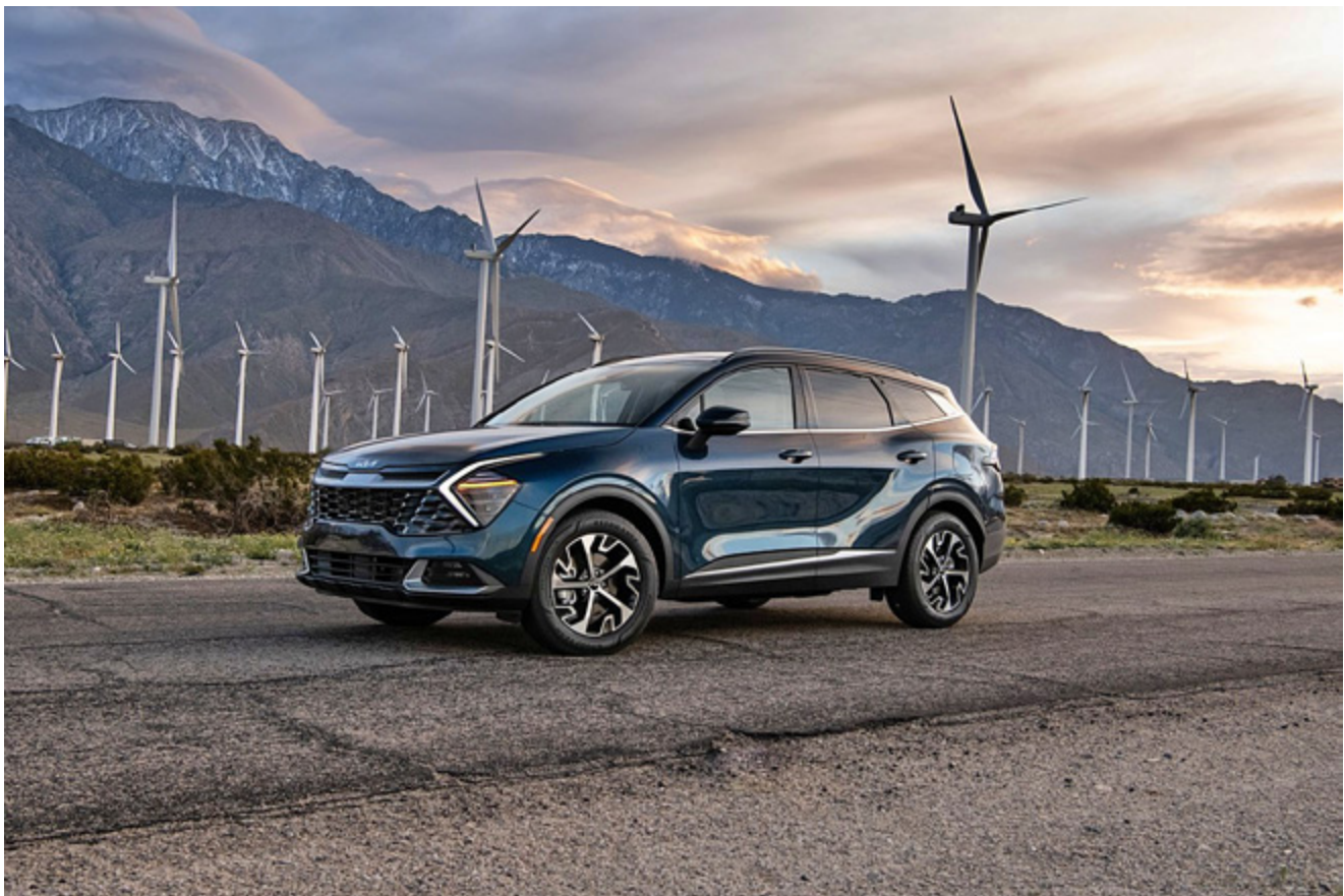
2023 KIA Sportage HEV

The Fourth generation Sportage was in showrooms for the 2017 model year. It was a moderate hit right out of the gate, especially in Europe where it would exceed 125,000 in unit sales, but the best was yet to come. Once again the 2017 Sportage earned a “Top Safety Pick” nod from the Insurance Institute for Highway Safety, showcasing the company’s commitment to improving safety standards. According to company literature, the fourth gen Sportage was inspired by state of the art fighter jet design. Three well received trim packages, continued design improvements and optional AWD configurations propelled Sportages sales over 80,000 three consecutive years for the first time, and even hit 94,000 cars sold in the U.S. for the 2021 model year. In what is now a seemingly automatic accolade, the 2022 Sportage received the “Top Safety Pick” rating from the Insurance Institute for Highway Safety, helping to launch sales over the 125.000 mark in the United States.