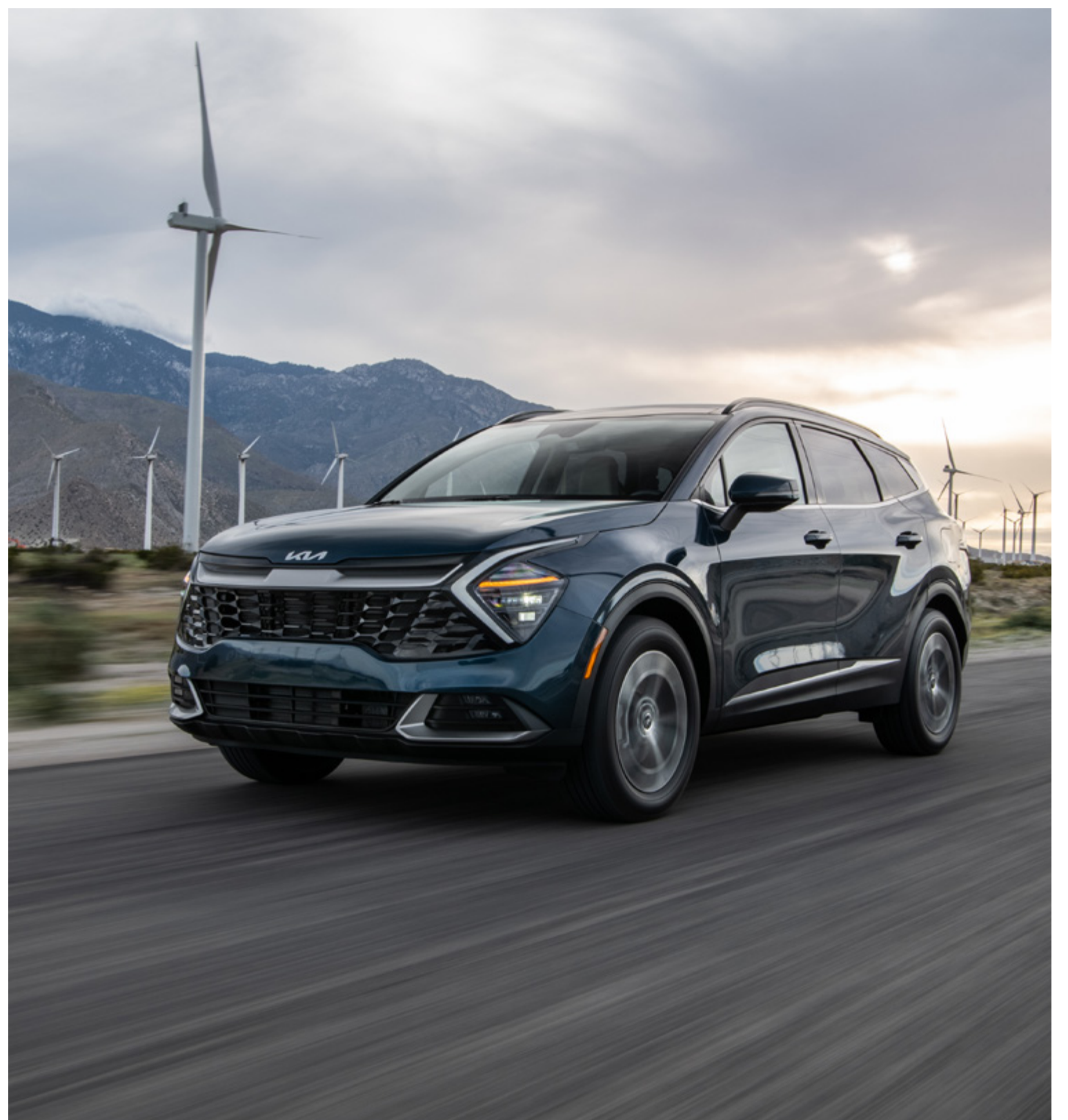
2023 KIA Sportage HEV