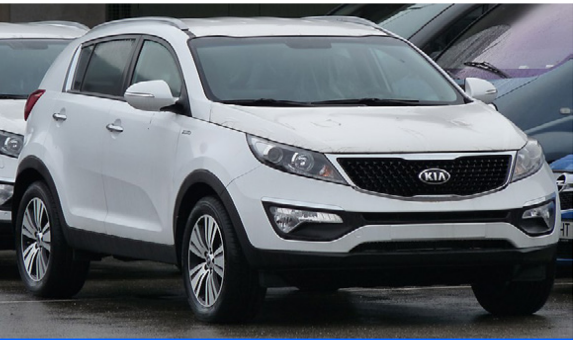
Third Generation Kia Sportage