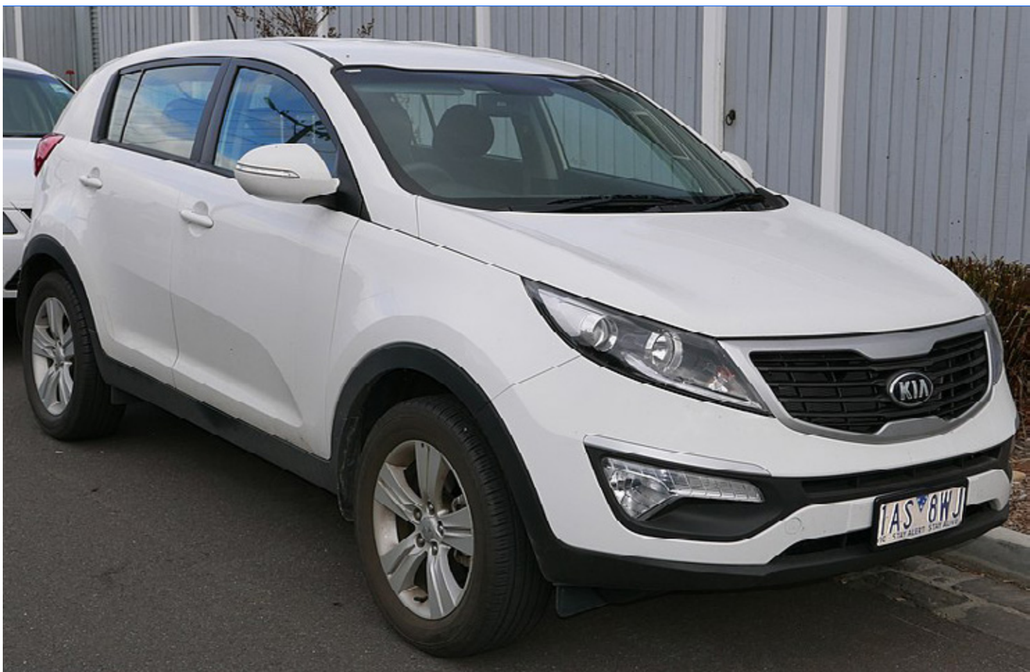
Third Generation 2013 Kia Sportage

ward design achievements, the third gen Sportage topped the 2012 J.D. Power Survey. Point of fact, it was the only automobile within that survey to attract a coveted five star rating broadly across all categories including in mechanical reliability, dealer experience and low ownership costs. Providing another boost to the gaining momentum for the Sportage was the vehicle’s tremendous improvements in safety design. While Kia had made notable, even historic advancements in safety engineering like being the first automaker to manufacture an automobile equipped with a knee airbag which was included with the 1997 Sportage, early Kia vehicles had a poor reputation for safety. But things had come a long, long way for the company, and the new third generation of Sportages earned the “Top Safety Pick” rating from the Insurance Institute for Highway Safety. Word was starting to get around about the Sportage, and in 2016 it sold 81,000 units, replacing the Rio as Kia’s best selling vehicle.