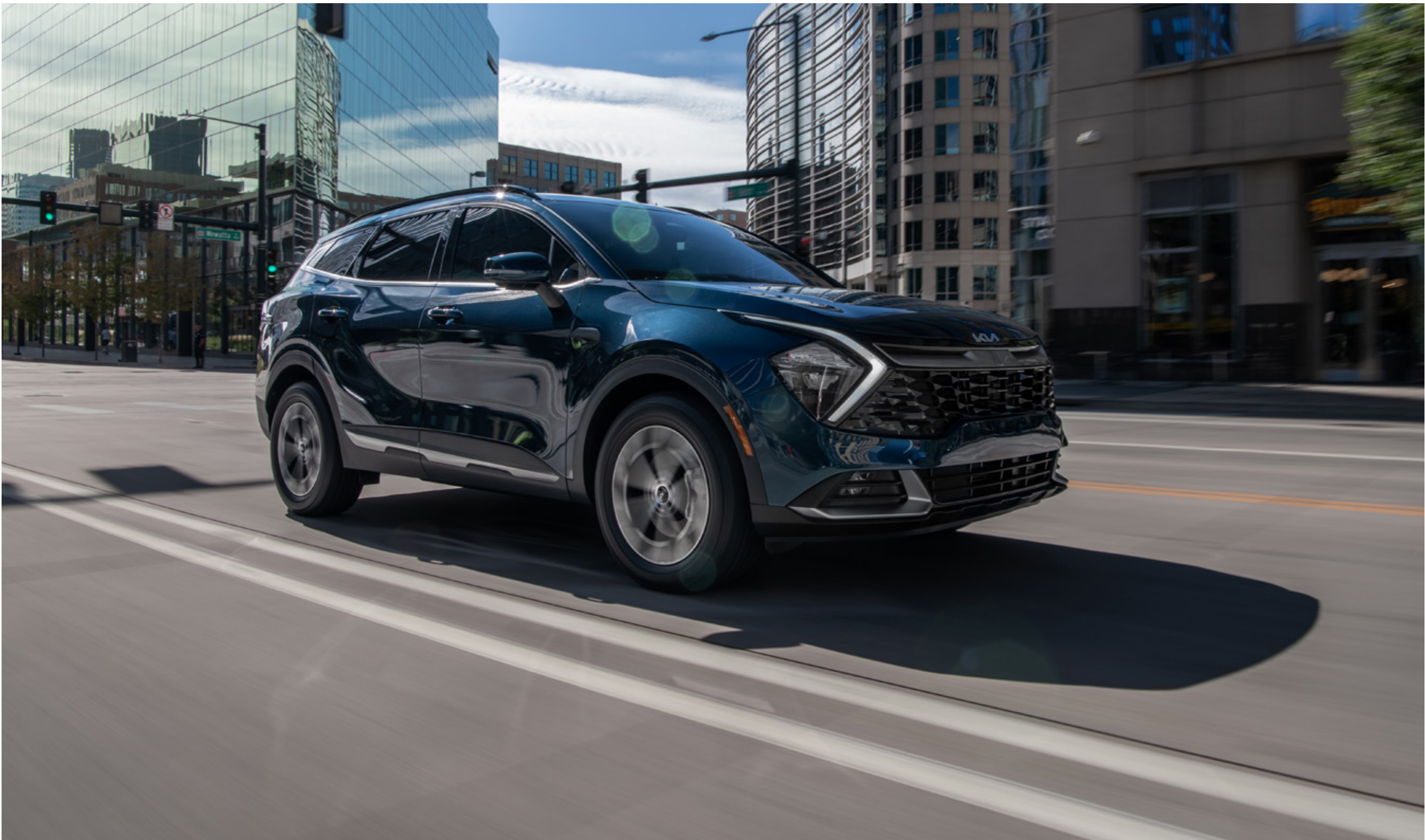
2023 Kia Sportage PHEV