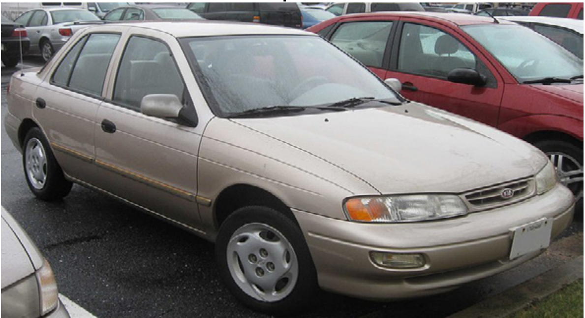
1994–1997 KIA Sephia

1992 saw a new U.S. division of the brand incorporated as Kia Motors America. At first, the vehicles were sold only at four auto dealerships located in Portland, Oregon. But growth was steady thanks in large part to the company’s brilliant strategy of expanding one region at a time and by 1995 there were well over 100 dealerships found in 30 states. Other strong contributors to rapid growth included the introduction of well received models like the Sephia, the first car that was truly designed by Kia on an independent chassis.