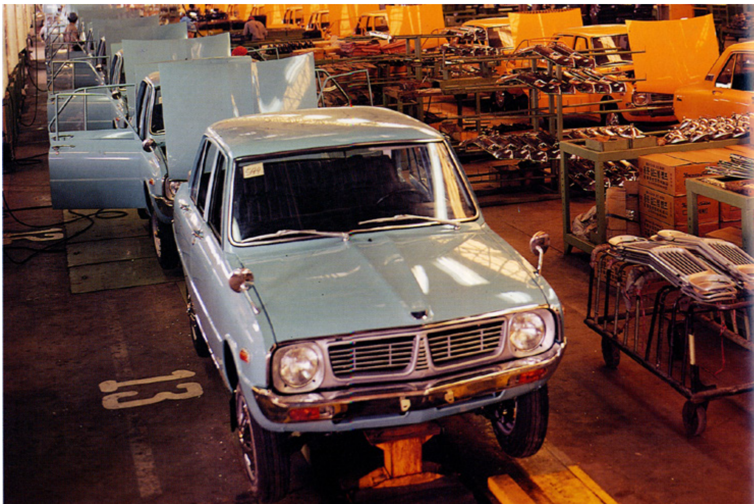
KIA Birsa on the assembly line

“Undoubtedly, the best way for a consumer to have a good time in the 2010s was to turn to Korean products: for a car, Kia and Hyundai; for electronics, LG and Samsung.