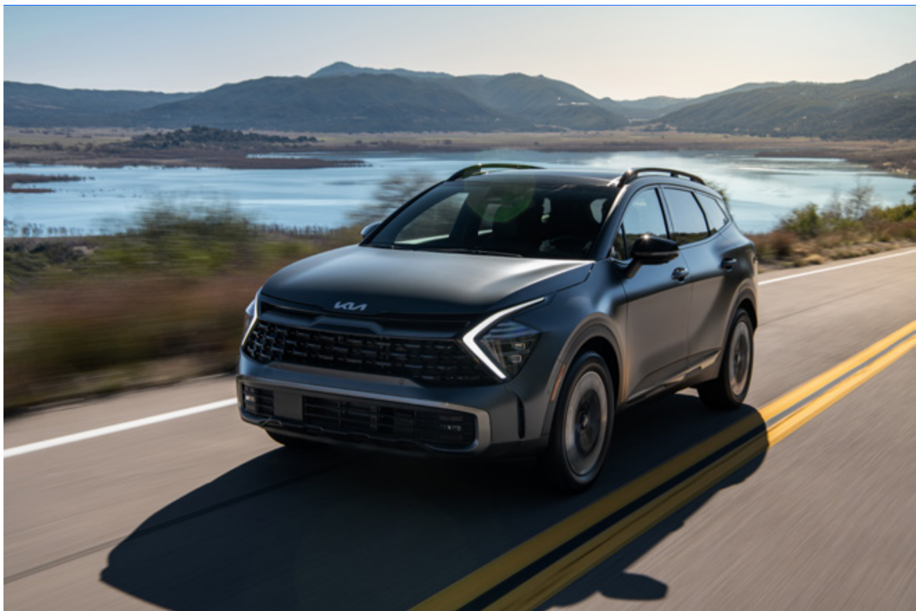
2023 KIA Sportage PHEV

Kia unveiled the fifth generation Sportage to a pandemic weary public in June 2021. It is based on