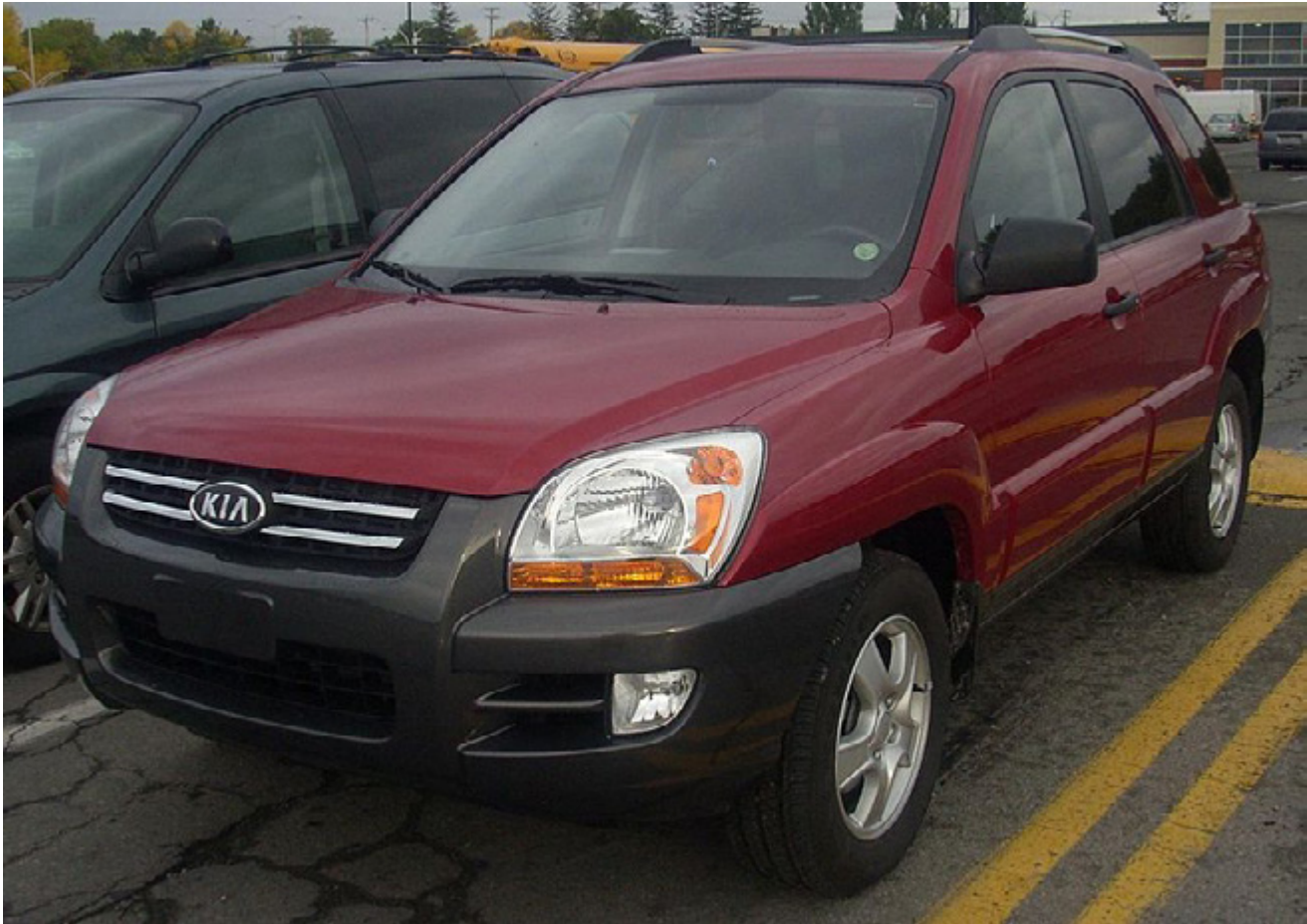
2005-08 KIA Sportage

Going back to the drawing board, the second generation of the Sportage was introduced into the North American market for the 2005 model year. With numerous improvements over the first generation, this was for all intent and purposes an entirely new automobile. Once again though, initial sales didn’t quite shatter any industry records. Still with a bad taste in their mouths and in conjunction with an unwillingness to gamble on unfamiliar car brands, consumers in the United States purchased only 29,000 units that year. The complaints from previous owners of the first generation Sportage spilled into the media, some citing the new model’s larger size and its lack of off-road capabilities. Automotive Critics were also mixed at best, with most reviews unwilling to move past the fledgling automakers previous perceived missteps, although some liked the new improved 173 bhp engine. Nevertheless, even the harshest critics of the Sportage had to concede one point, the second generation of the vehicle was a vastly better automobile than the first.