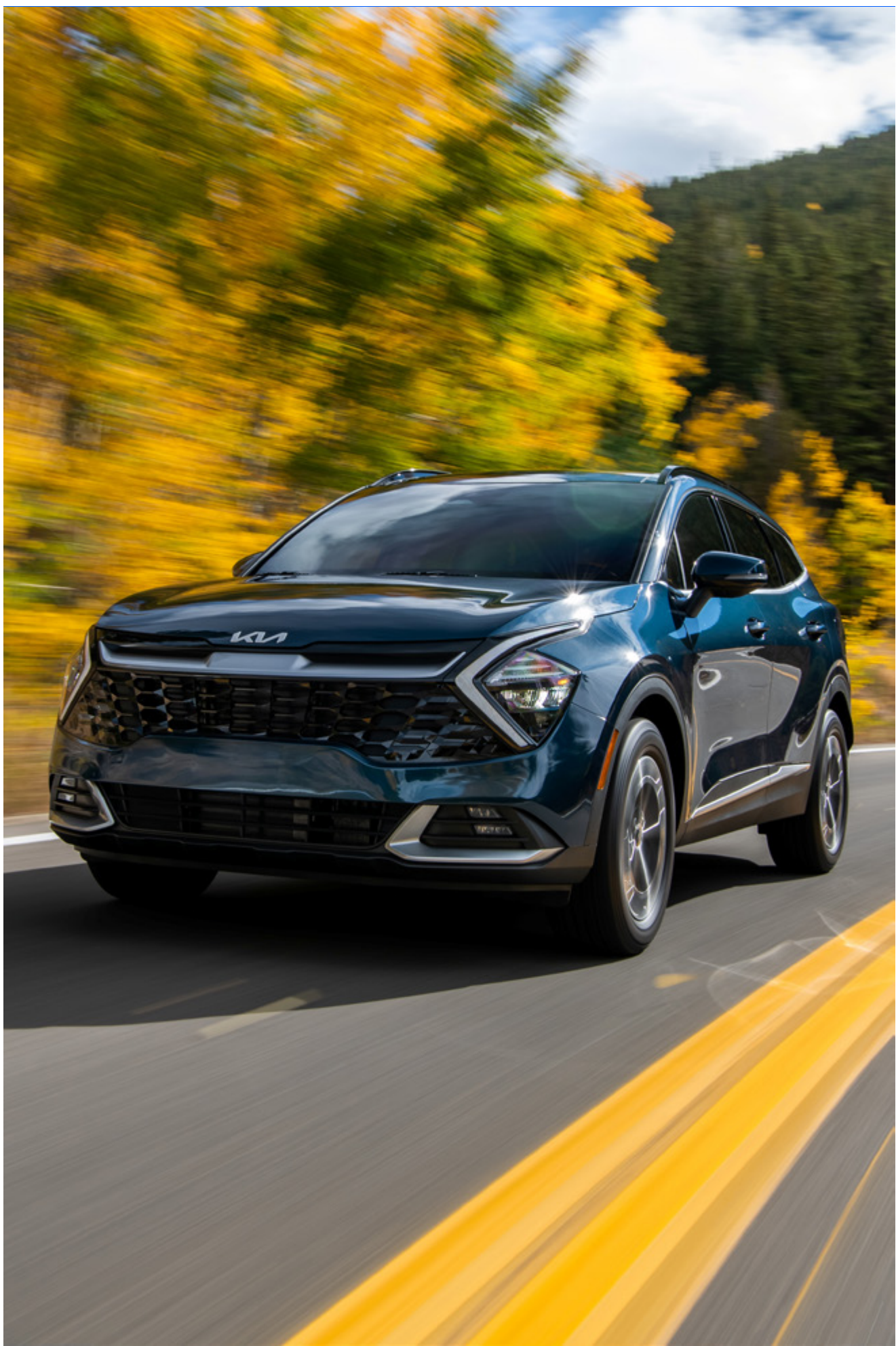
2023 KIA Sportage HEV