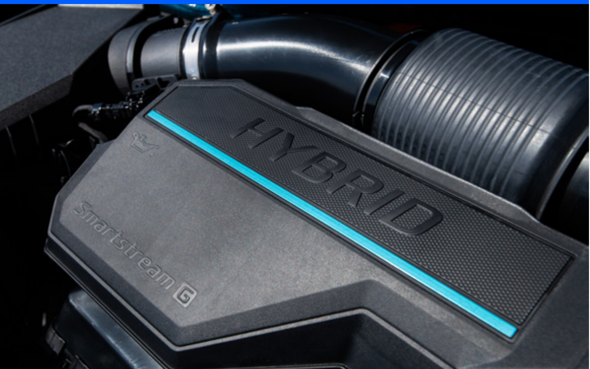
Powerful 2023 Kia Sportage HEV motor