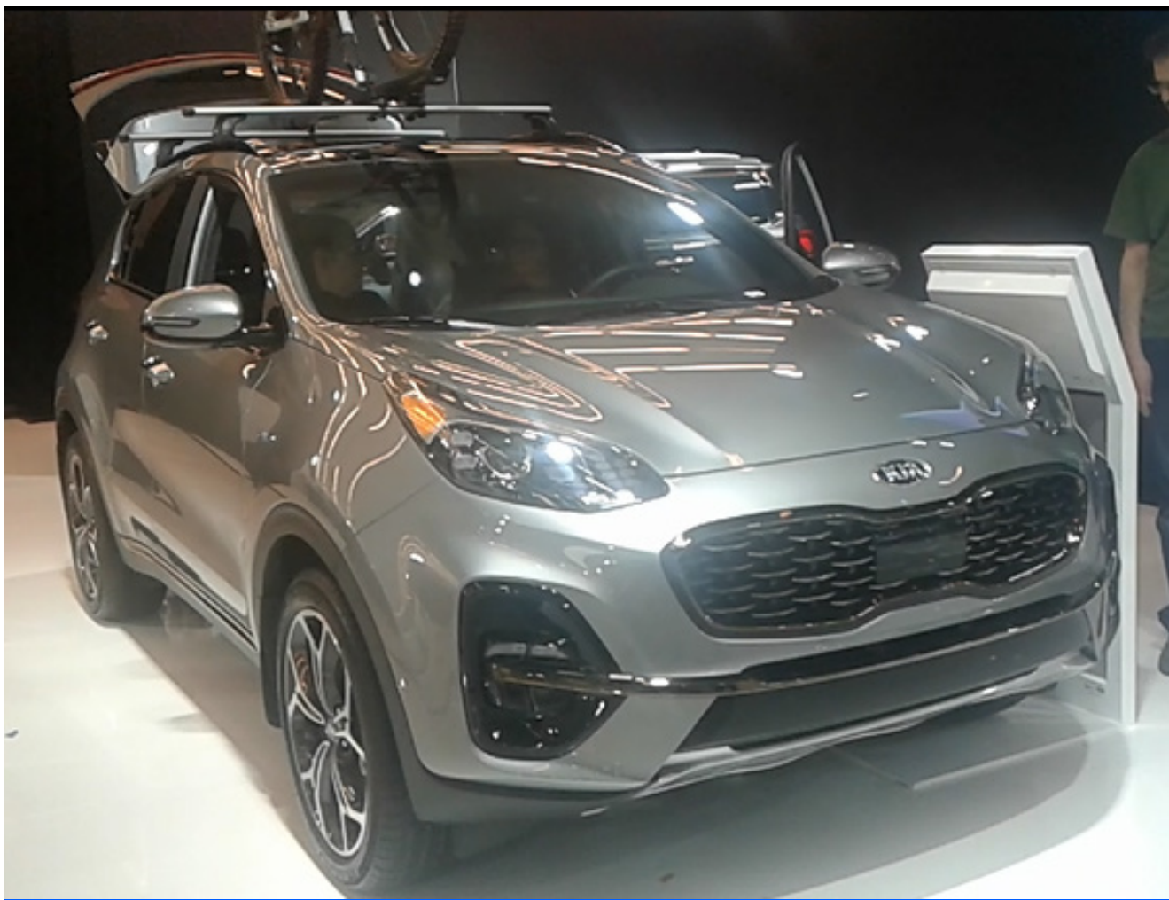
2017 KIA Sportage

”Once again the 2017 Sportage earned a “Top Safety Pick” nod from the Insurance Institute for Highway Safety, showcasing the company’s commitment to improving safety standards.”