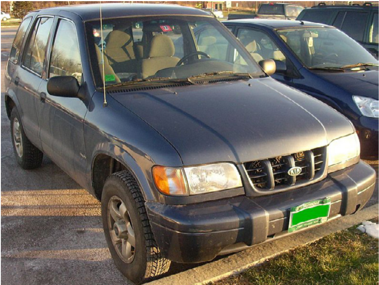
First Generation KIA Sportage 1993-2002 NB-7

Going back to the drawing board, the second generation of the Sportage was introduced into the North American market for the 2005 model year. With numerous improvements over the first generation, this was for all intent and purposes an entirely new automobile. Once again though, initial sales didn’t quite shatter any industry records. Still with a bad taste in their mouths and in conjunction with an unwillingness to gamble on unfamiliar car brands, consumers in the United States purchased only 29,000 units that year. The complaints from previous owners of the first generation Sportage spilled into the media, some citing the new model’s larger size and its lack of off-road capabilities. Automotive Critics were also mixed at best, with most reviews unwilling to move past the fledgling automakers previous perceived missteps, although some liked the new improved 173 bhp engine. Nevertheless, even the harshest critics of the Sportage had to concede one point, the second generation of the vehicle was a vastly better automobile than the first.