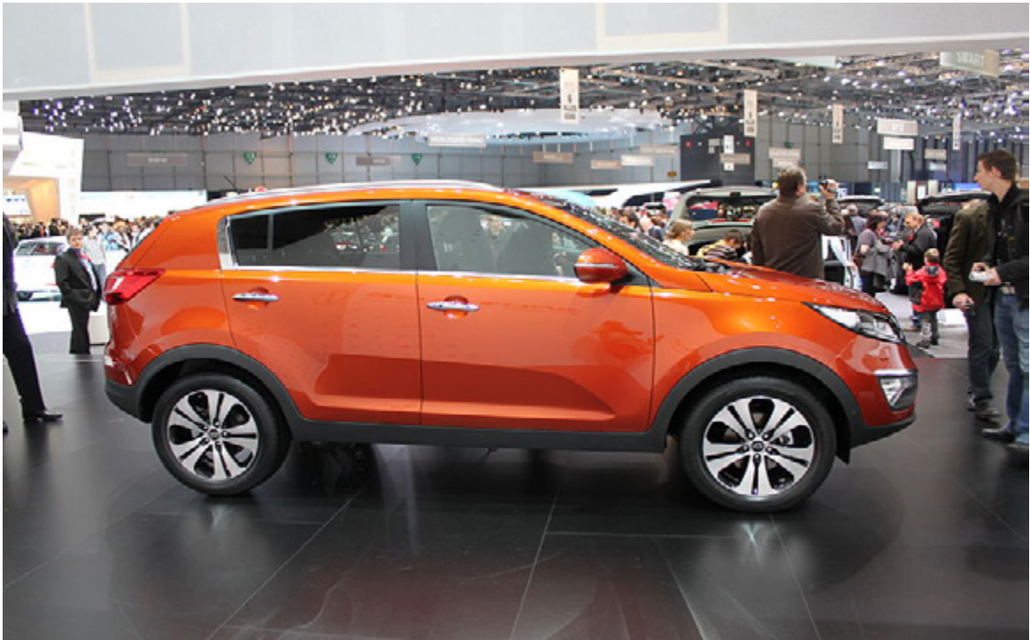
Third Generation Kia Sportage