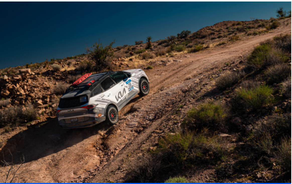
The Kia Sportage climbing a steep hill

the successful N3 platform and has received numerous critical praises. Points of note from automotive critics have been the model’s Terrain Mode which, depending on conditions, automatically adjusts various vehicle settings for optimal safety. Also receiving raves from both critics and owners alike is a three inch increase in legroom with a bit more headroom to boot. The fifth gen Sportage is also American made, produced at Kia Motors Manufacturing in West Point, Georgia, representing a $1 billion investment into U.S. infrastructure that opened in February 2010. You may be asking “Did the 2023 Sportage earn a Top Safety Pick award from the Insurance Institute for Highway Safety?” You bet your bottom dollar it did. As a matter of fact, the Kia Sportage earned its best safety score ever for this model year.