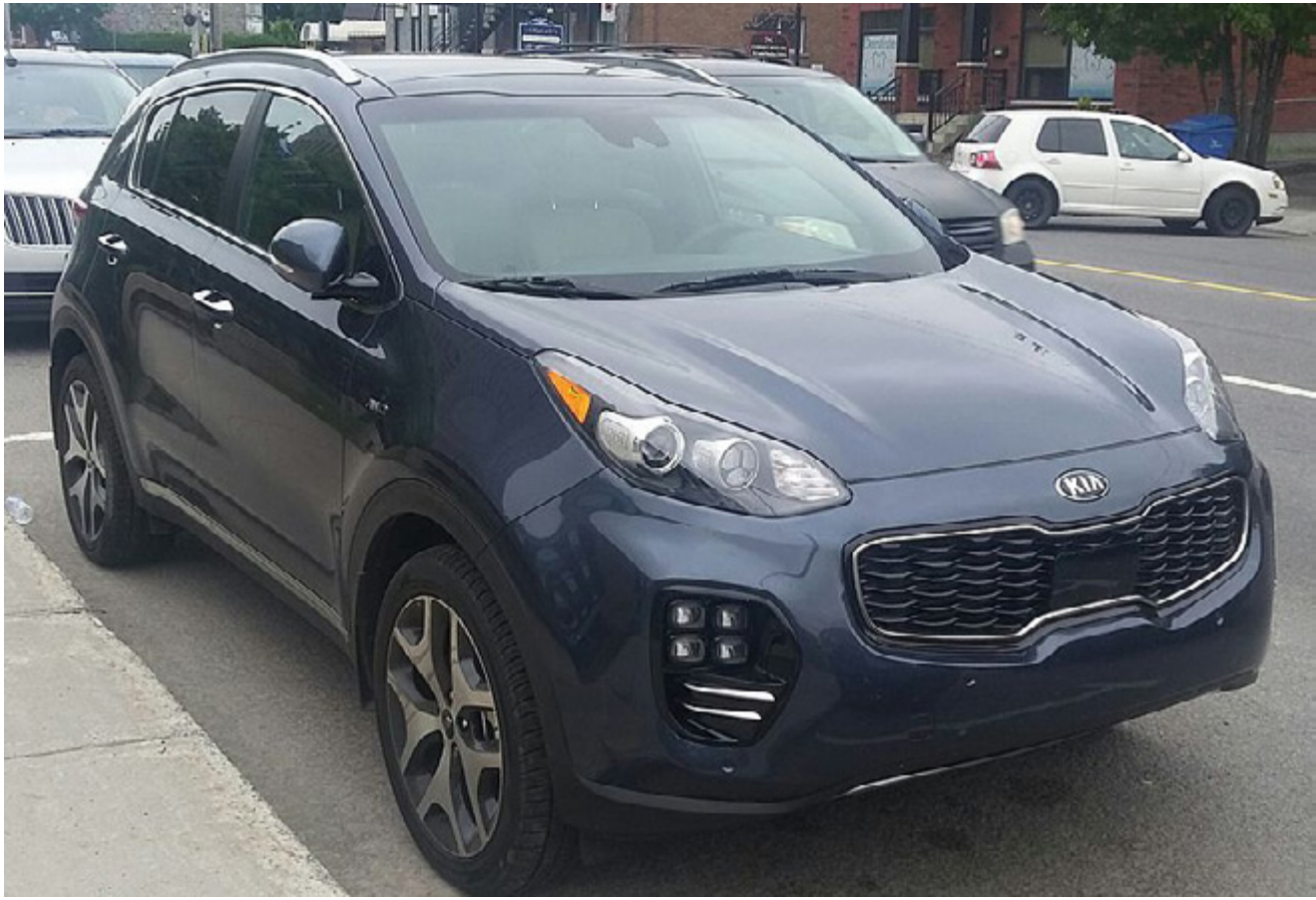
Fourth Gen KIA Sportage